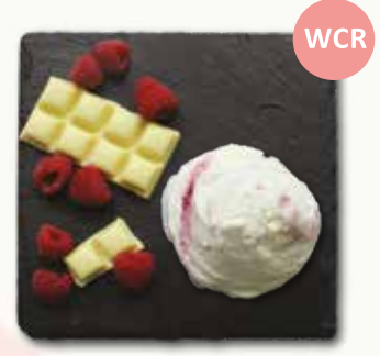
White Choc Raspberry Truffle