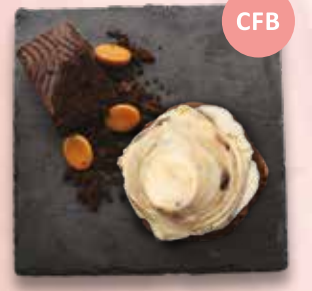
Caramel Fudge Brownie