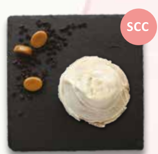
Swiss Choc Caramel