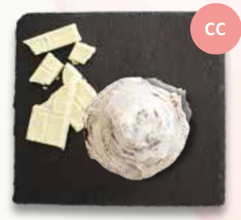
Cookies & Cream