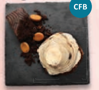
Caramel Fudge Brownie